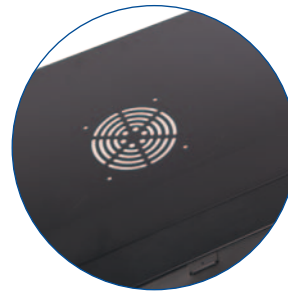
Top & Bottom Cable Entry With Gland Plate