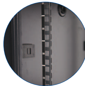
Printed "U" Markers, Front & Rear