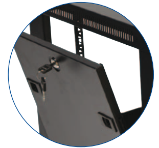
Lockable, Removable Side Panels