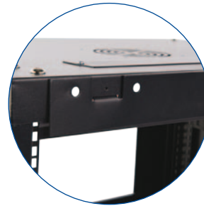
One Man Mounting Panel