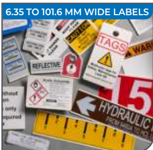
6.35 TO 101.6 MM WIDE LABELS