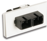
MX-SMB-SC-(XX) . . . . . 2-port bezel with one duplex SC adapter*