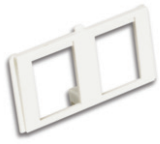
MX-SMB-MM-(XX) . . . . . 2-port multimedia bezel