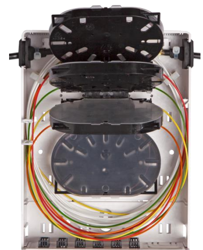
Easy box 48S (48 splices, only G.657 a, b)