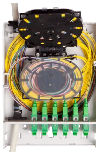
Patching with covered adaptors (24 splices, only fibres G.657 a, b; 6xSC duplex)