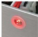
Red: stand by