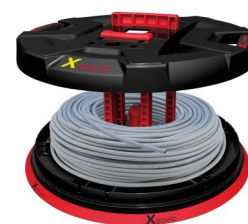
For use with loose cables