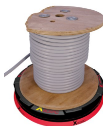
Ideal for damaged drums